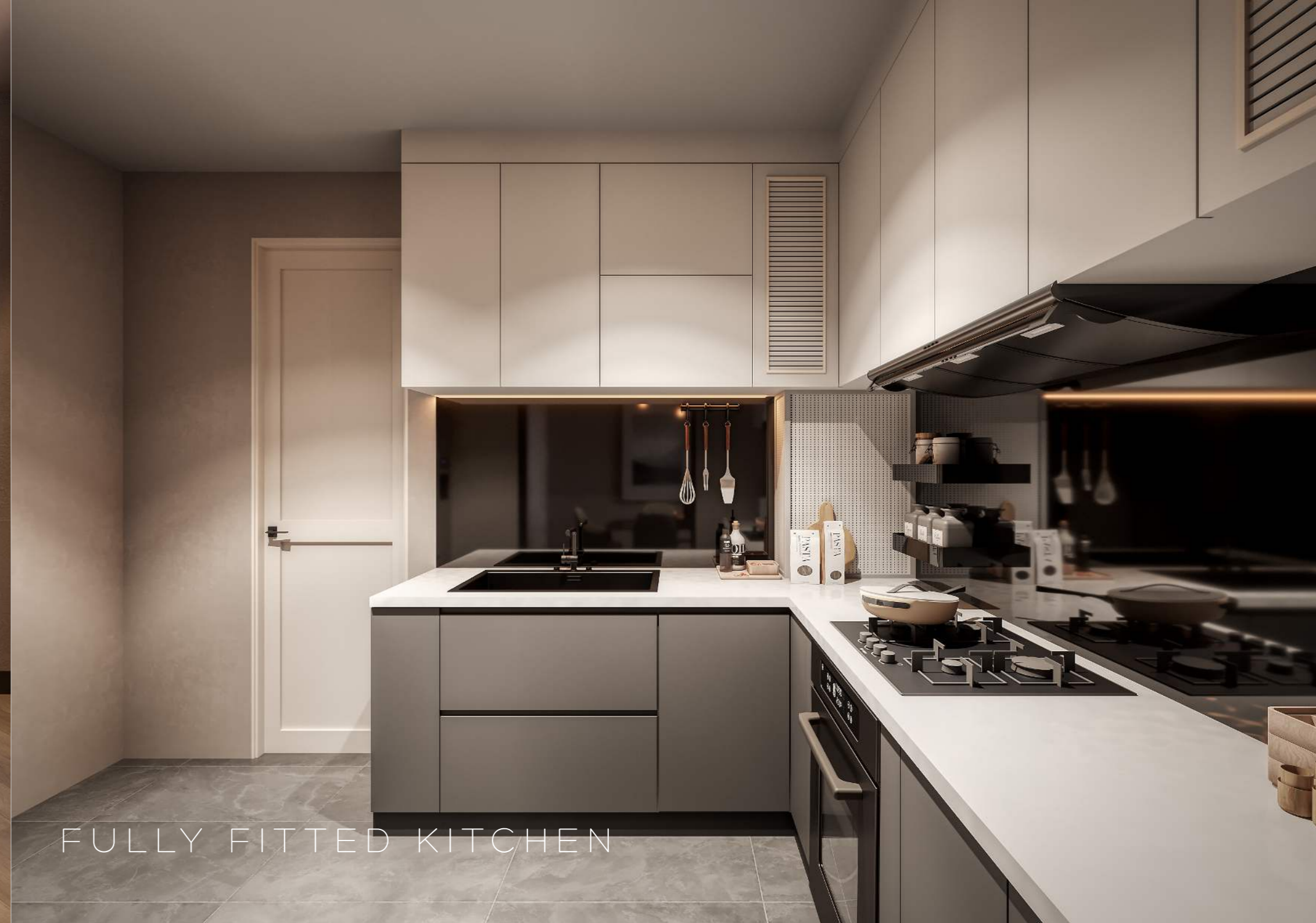
FULLY FITTED KITCHEN